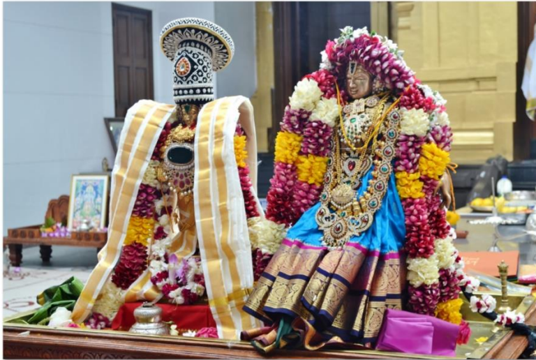
Andal Kalyanam 2017

Please visit our website www.sriandalsydney.org for latest updates.