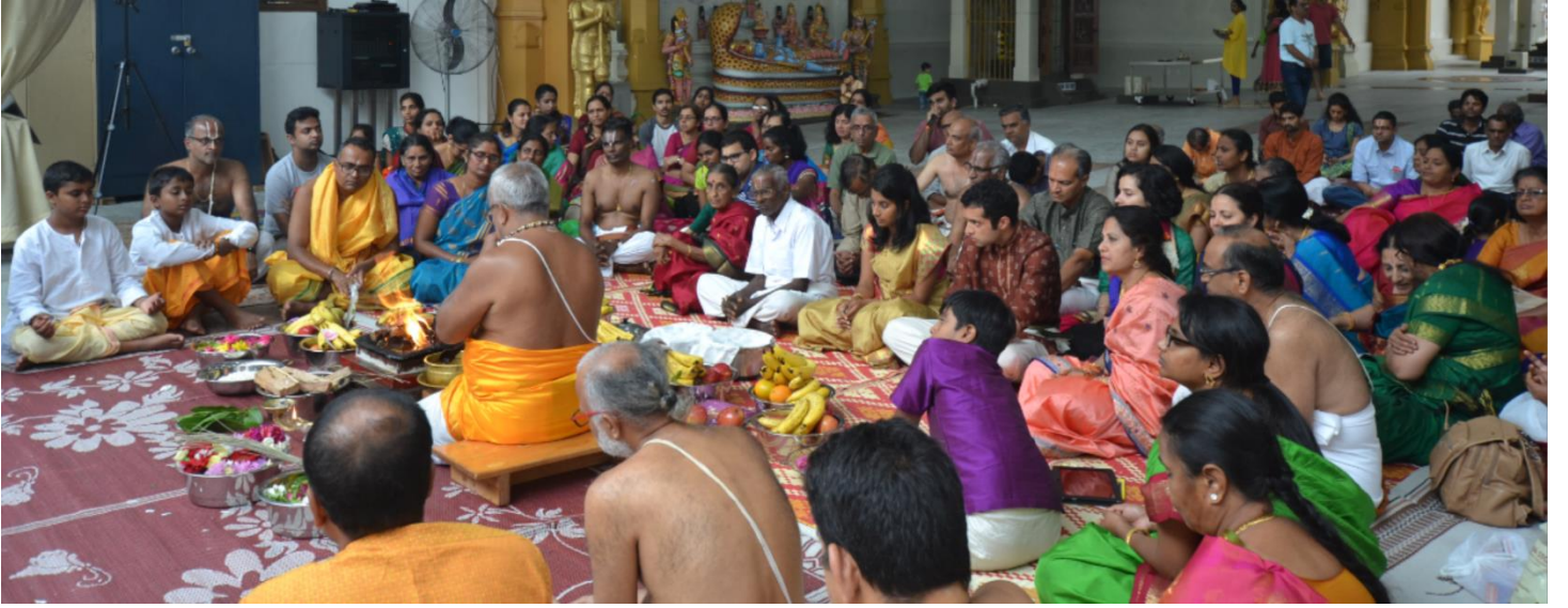
Andal Kalyanam 2017